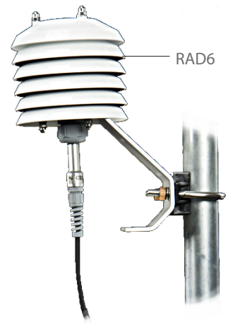
The RAD6 6-plate shield attaches to a mast by placing the U bolt in the side holes.

*Older sensors (serial numbers less than E13405) had a power supply voltage range of 6 to 18 Vdc.